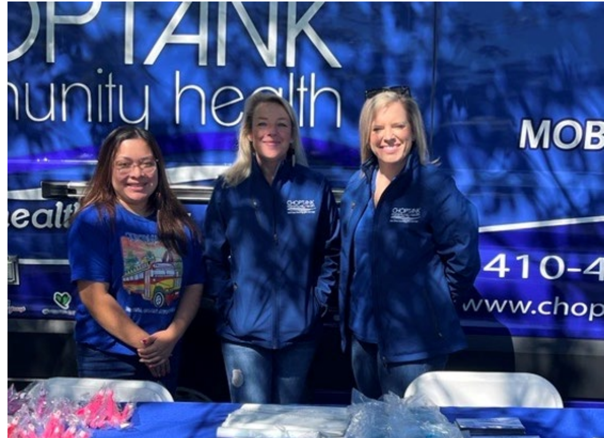
School Based Dental Staff with CCHS Certified Interpreter at the Multicultural Festival in Easton, MD