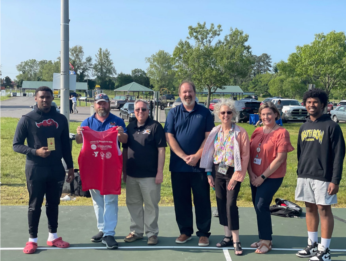
Weekly nutrition education and healthy snacks available for student athletes during community basketball camp.