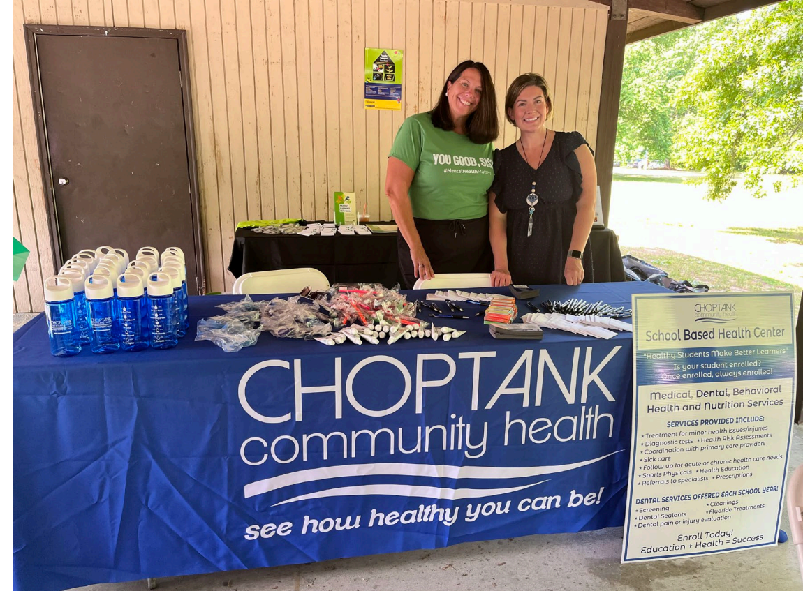
Nutrition team promoting all SBHC services available through Choptank at a community event.